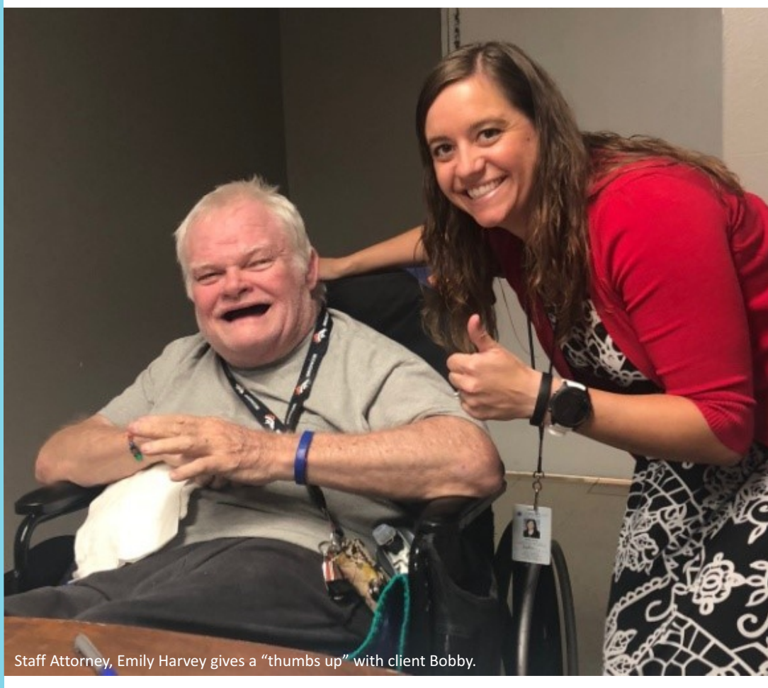
2018 ANNUAL REPORT

Promoting & Protecting Disability Rights